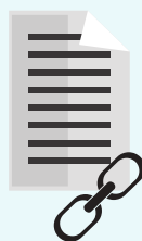
Download Hyperlinked Doc